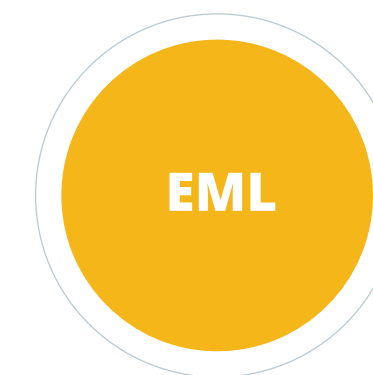
Entrepreneurially Minded Learning Educational Outcomes to Develop Skillset and Mindset in Students